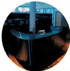
Resolution 4: Internet Appliance Network