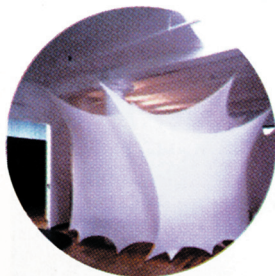
Resolution 4: Thunderhouse

Fabric structures are ideal for clients who consider dry wall too big a commitment.